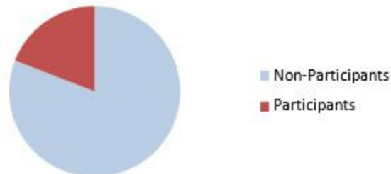
2021-22 Student-Athlete Participation (Female)